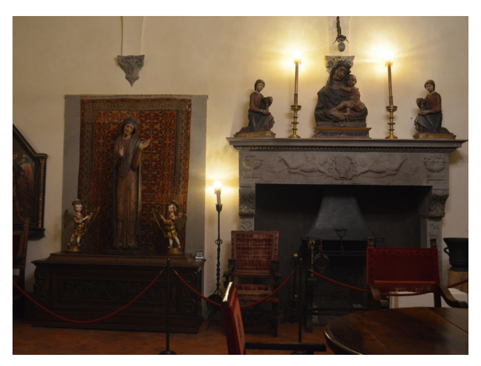
Fig. 1 Sala da Pranzo – Monitoring RH and temperature.

In 1994, the collections – comprised of more than six thousand artworks, a library of 12,000 volumes and an archive of photographs, contained within a historic 15<sup>th</sup> century Villa and gardens – were left to NYU. NYU's Institute of Fine Arts (IFA) established a holistic