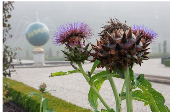
The Edible Garden at Paleis Het Loo