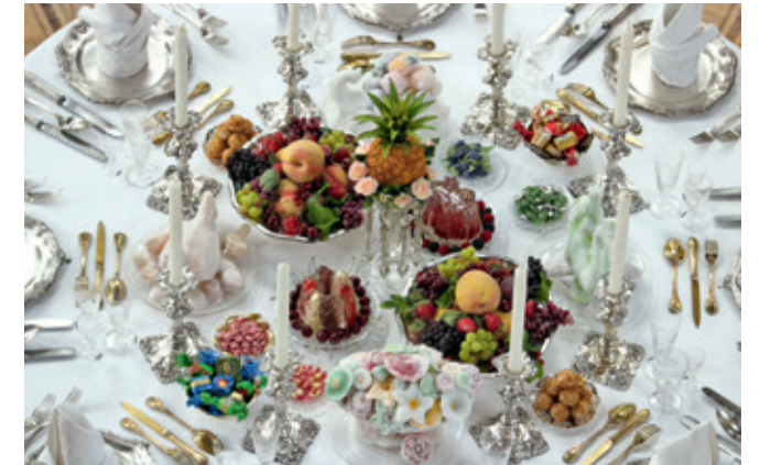
Decorated table for the Prince Pückler exhibition

Integrated into our international music festival in Potsdam (Musikfestspiele Potsdam Sanssouci), we will share a special highlight on 23 rd June 2018 (Saturday) with other palaces