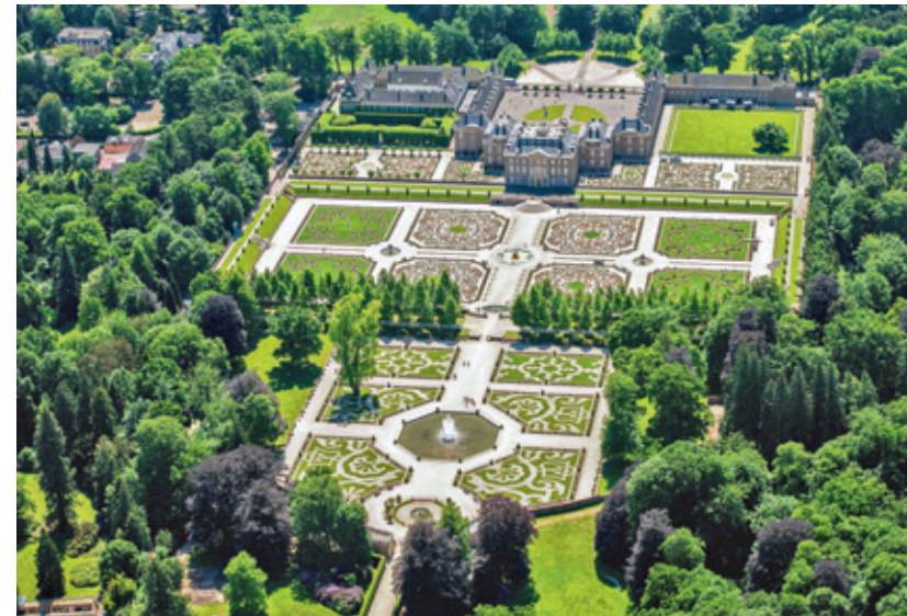
Paleis Het Loo