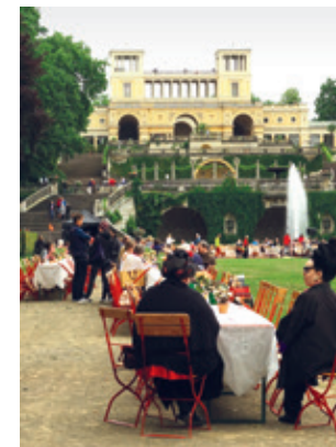
Open-air event