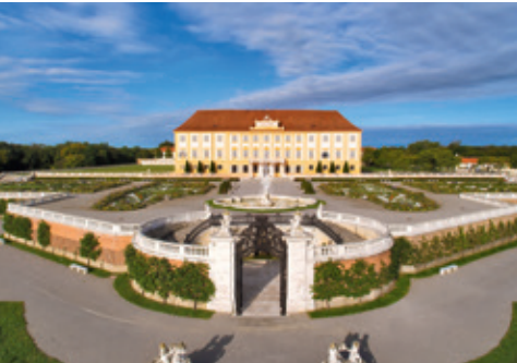
Schloss Hof