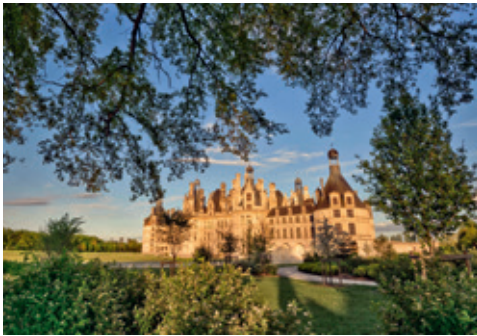
English Garden