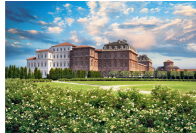
Palace of La Venaria Reale