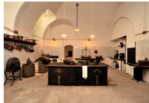
Turin, Royal Kitchens