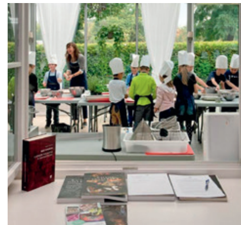
Museum of King Jan III's Palace at Wilanów, Culinary workshop with children