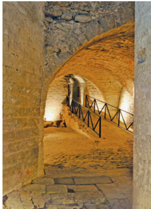
Cellars of the "corps du logis"