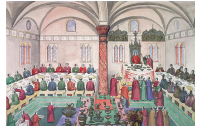
Feast in the Faceted Chamber. Lithograph, 1856. Miniature from the 'Book about election for the most high throne of great Sovereign, Tsar and Great Prince Michael Fyodorovich'. Moscow, 1672-1673