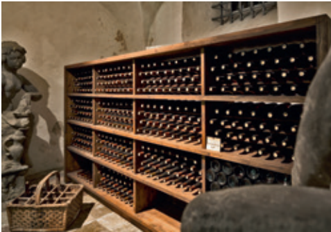
The Rosenberg wine