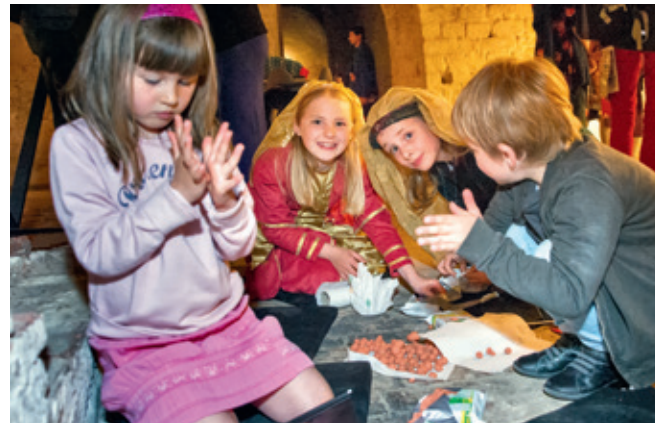
The Coudenberg Palace "Family Day"