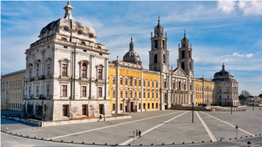
National Palace of Mafra