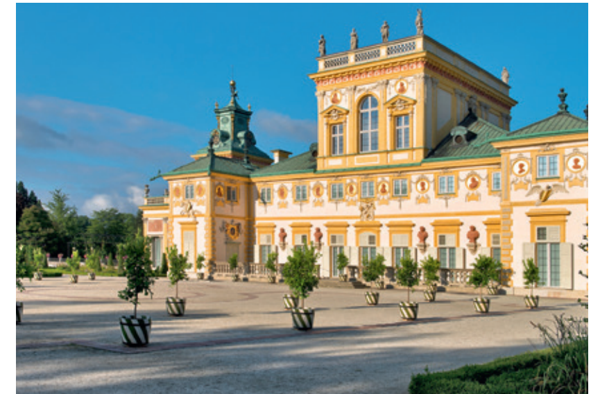
Wilanow Palace Museum