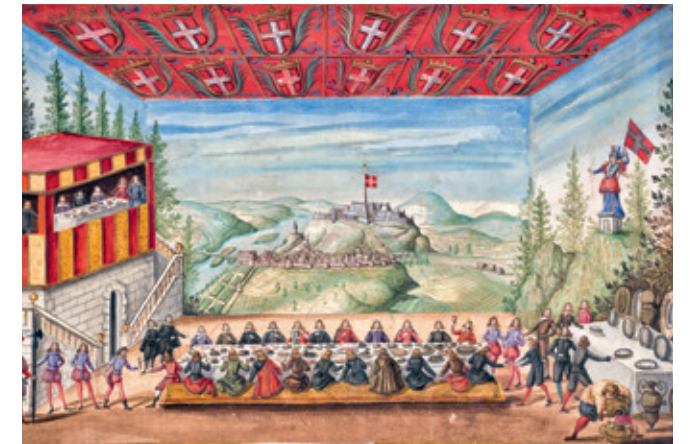
Meal of the court of Savoy in the room of the Palace of Rivoli (1645), by T. Borgonio