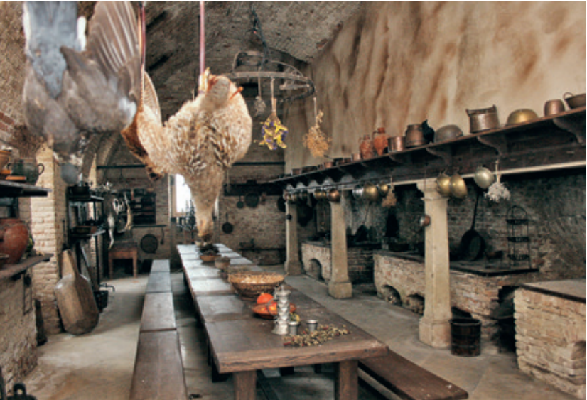
Game Kitchen Schloss Niederweiden

PERIOD 15 th March — 18 th November 2018