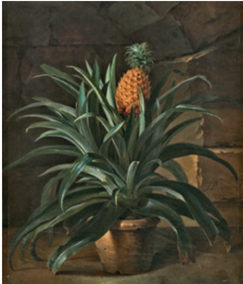
Detail of the Pineapple by Jean-Baptiste Oudry (1686-1755).