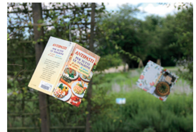
Open-Air Event