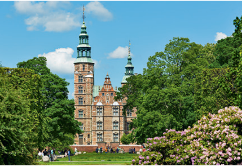
Rosenborg Castle