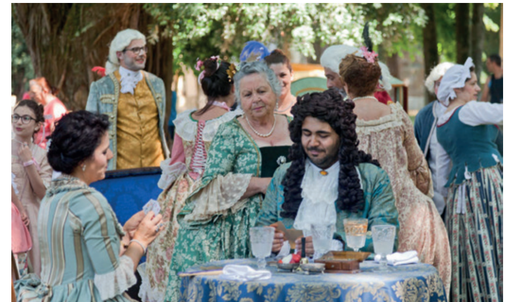
Open-Air Event