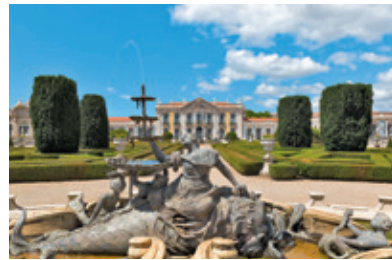
National Palace of Queluz, the ceremonial facade and the hanging gardens