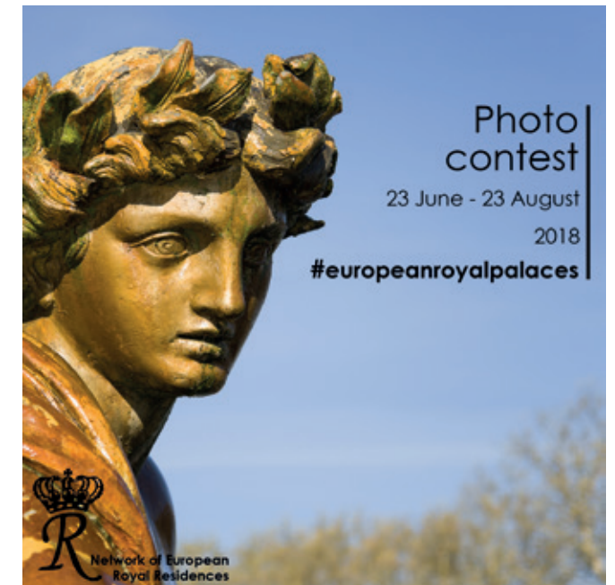
Instagram Photo Contest