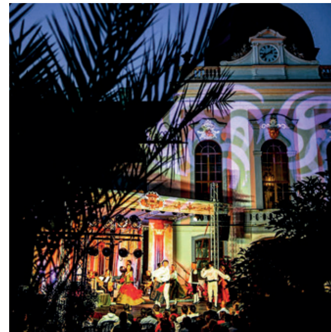
Open-Air Event

Closing dinner at the Château de Versailles bringing together 5 starred chefs working with Royal Residences in Europe over a meal, inspired by historical menus. Combining old culinary traditions with recent innovations, mixing European habits and techniques, this dinner pays tribute to centuries-old European haute cuisine, recognized as one of the best in the world.