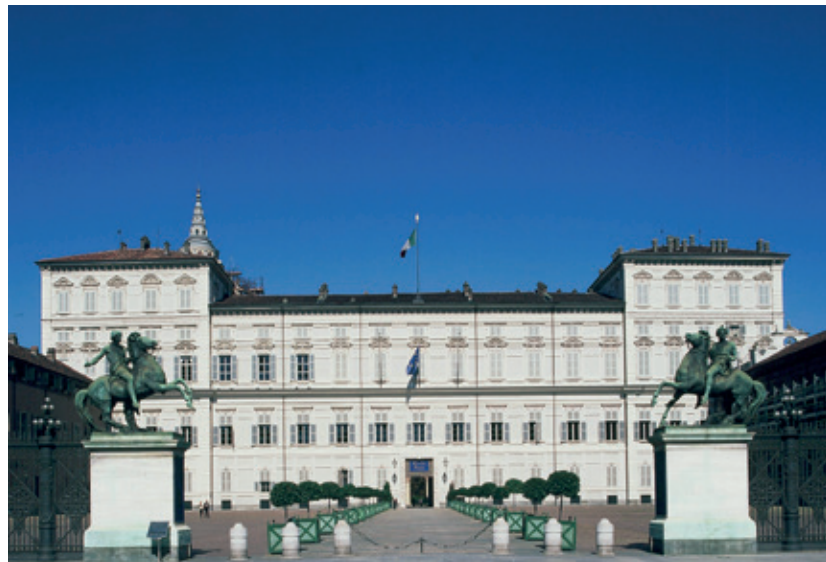
Royal Palace