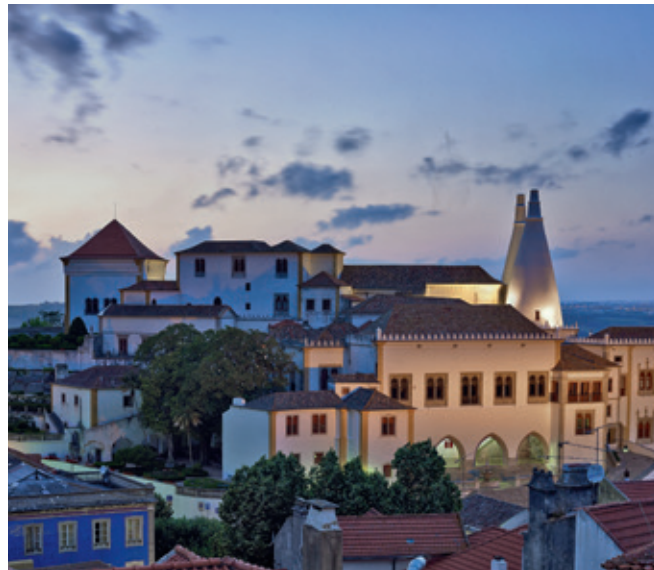
National Palace of Sintra.