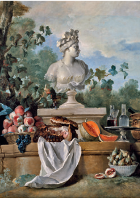
Still life with the bust of America by Jean-Baptiste Oudry (1686-1755).