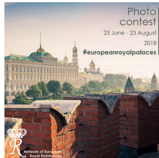
Instagram Photo Contest, Moscow Kremlin Museums