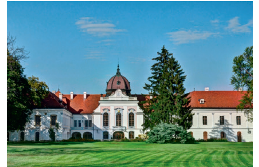
Royal Palace Park