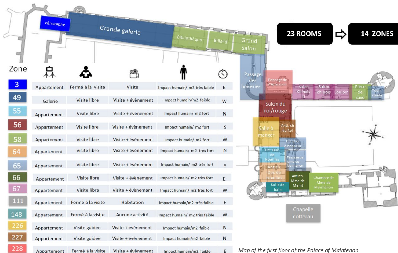
Map of the first floor of the Palace of Maintenon

*On the map we have the name of the room and the color of the zone