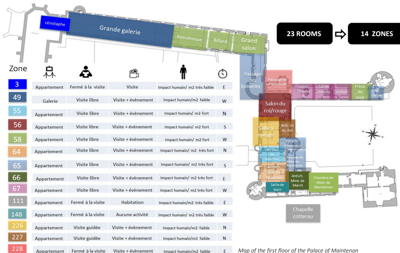
Map of the first floor of the Palace of Maintenon

Zoning makes it possible to group rooms with similar characteristics (museography, type of visit, activities (film shoots events...), human impact and orientation) with have similar impact on the collection.